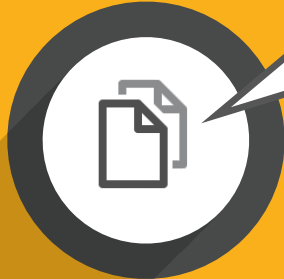
Online Cheating and Plagiarism

Cheating and plagiarism happen online and offline. We remind students that they must comply with Concordia's regulations. We also design online tests to be made up of bigger banks of questions with randomized selections of questions and answers, and we are working on implementing the latest online cheating detection mechanisms.