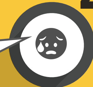
Face-to-Face Communication & Support

Your online content does not replace your academic support. Students still need you and each other. That's why we take every opportunity to create collaborative learning experiences, introduce peer-led instructional practices and interactive communication, and implement peer and collaborative assessment strategies for desired outcomes.