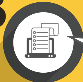
Technology and Digital Literacy

You don't have to be a techie to make an online course; we do. We choose production strategies and technological tools to fit your needs. We also train you and your teaching assistants on how to use your course and once live, we help with technical issues if needed.