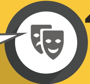
Gamification in Learning = Edutainment versus Learning

Gamification in learning is not a marketing ploy. We use it to personalize learning and increase intrinsic and extrinsic motivators in a course. When designing game elements and strategies for your course, we use multi-strategy teaching approaches with a backward development so that we increase student engagement, performance, and learning.